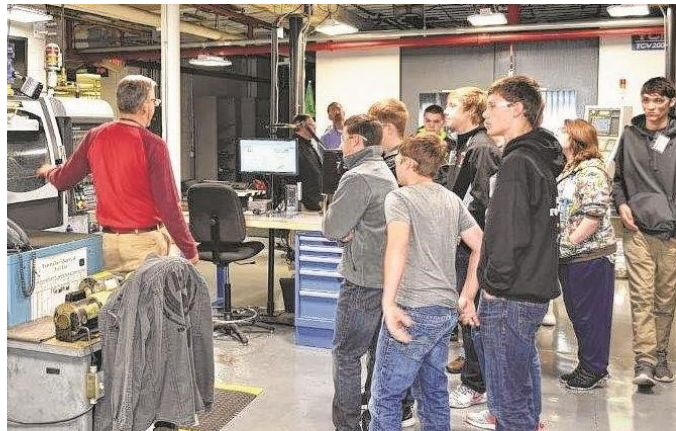
Triad Advanced Manufacturing students tour Honeywell ..

The Advanced Manufacturing program is taught by