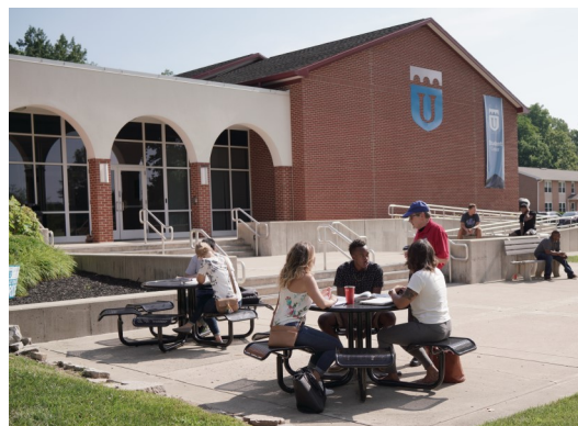
Students gather outside the UU Student Center.