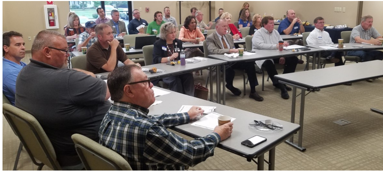
CEP Board members and community partners listen to a presentation at the CEP's Annual Investors and Grantors Meeting in September at Pioneer Electric Cooperative.