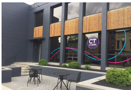
CT Comm completed a major renovation of its downtown Urbana building in 2018.