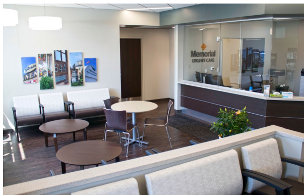
Urgent Care reception area of Memorial Health Urbana Medical Center.