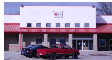
Advanced Technology Products building in Mechanicsburg.

ATP requested the annexation to provide the Mechanicsburg facility full access to village services, including police and fire protection, snow removal, ice control, routine road maintenance and utility services provided at reduced incorporated area rates.