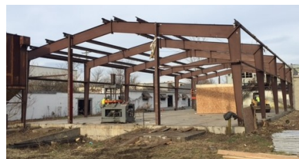
One of buildings being dismantled and moved in Q3 redevelopment project.