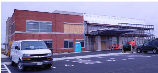
Memorial Health's new Urbana medical building will be ready for a grand opening this spring. (See photos of other economic development projects on Page 4.)