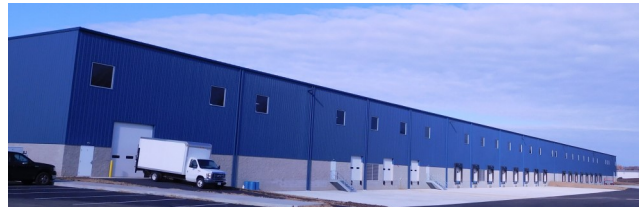
Navistar began moving material in December into its new distribution center at the Urbana Industrial Park.

retained jobs, $835,000 new payroll, $9.3 million retained payroll and $2.7 million investment