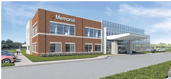
Drawing of proposed Memorial Health building.

Under the proposal, Urbana MOB as the property owner would receive a 10-year, 75 percent exemption on real property taxes that result from the construction, estimated to cost $9,993,000 to $10,703,000. The building site, which is within city