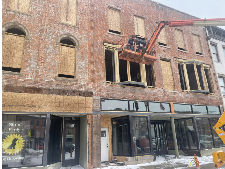
PROGRESS ON THE SQUARE IN DOWNTOWN URBANA