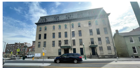
LEGACY PLACE MONUMENT SQUARE, FORMERLY DOUGLAS HOTEL IN DOWNTOWN URBANA.