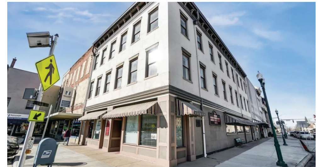
THE NEW CEP OFFICE IS LOCATED IN DOWNTOWN URBANA AT 40 MONUMENT SQUARE, SUITE 306

Saint Paris and Mechanicsburg are receiving grants to improve their water lines and new businesses are being discussed daily. North Lewisburg is saying goodbye to long time administrator and CEP board member