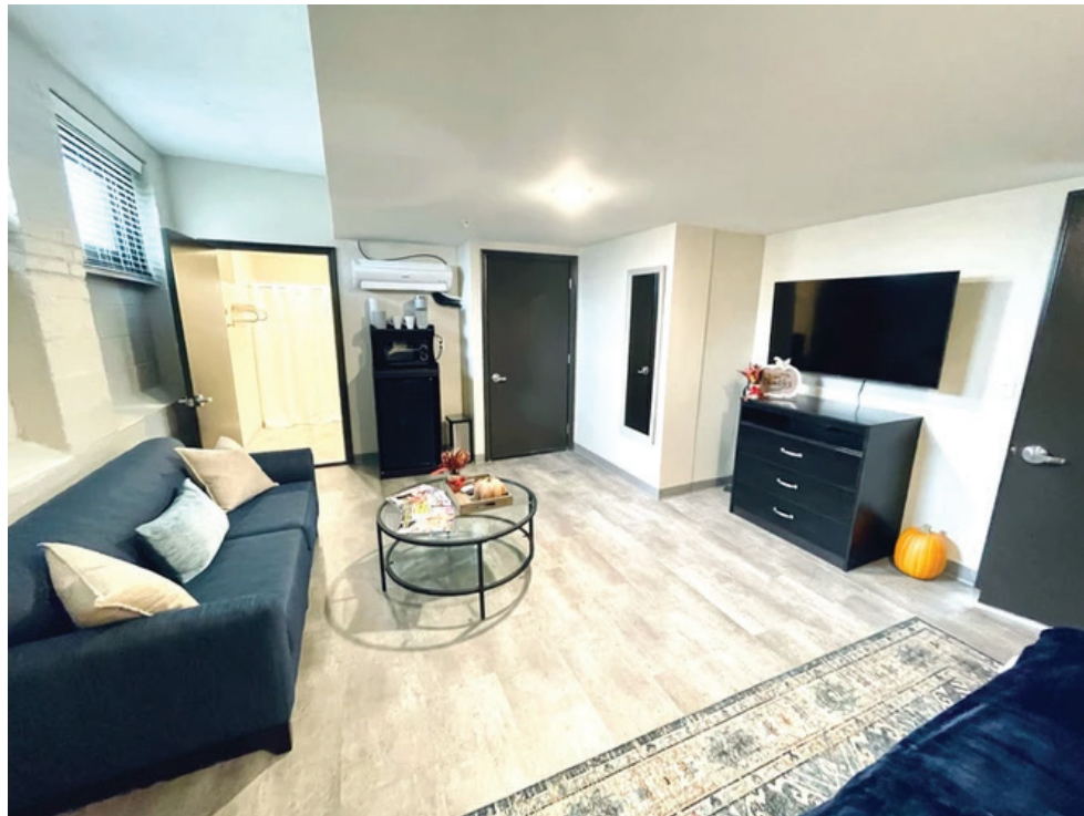
LEGACY PLACE MONUMENT SQUARE, FORMERLY DOUGLAS HOTEL IN DOWNTOWN URBANA.

Urbana's Downtown warms my heart. The transformation of all three buildings has been amazing. The impact of this project on our community will be felt for many years to come. In all three building, the apartments are large and comfortable as well as cozy and clean. Residents coming to live in these apartments will be thrilled with the amenities and features along with the unique setting each is in. After touring the buildings, I've been most impressed with the attention to detail by the designers and builders. It will be an absolute asset to Urbana and Champaign County for years to come!" All three apartment buildings are currently accepting applications for future residents aged 55 and older. For information on tours or leasing, contact legacyplace@herronmgmt.com