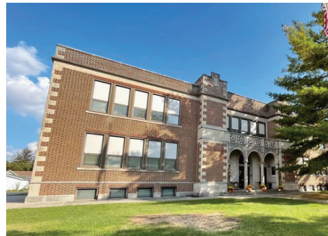
LEGACY PLACE SOUTH, FORMERLY SOUTH ELEMENTARY SCHOOL IN URBANA.