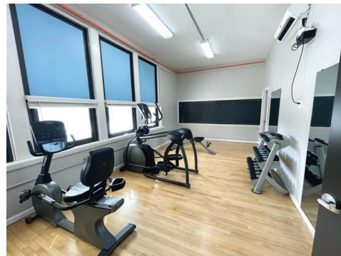
LEGACY PLACE MONUMENT SQUARE, FORMERLY DOUGLAS HOTEL IN DOWNTOWN URBANA.