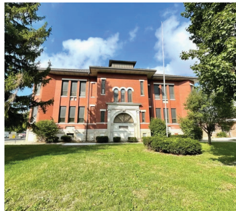
LEGACY PLACE NORTH, FORMERLY NORTH ELEMENTARY SCHOOL IN URBANA.