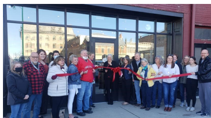
Ribbon cutting at In Good Taste Market.

As we emerge from the pandemic, community events are returning. To name a few, Art Affair on the Square, the Simon Kenton Chili Cook-off, the Balloon Fest. Watch for updates.