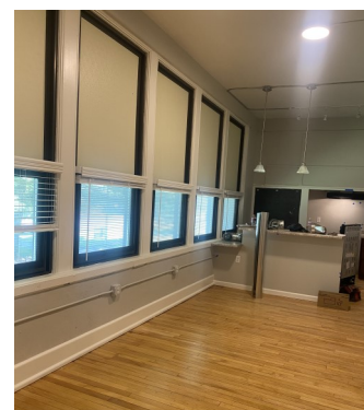
Apartments at Legacy Place North and South are nearing completion.